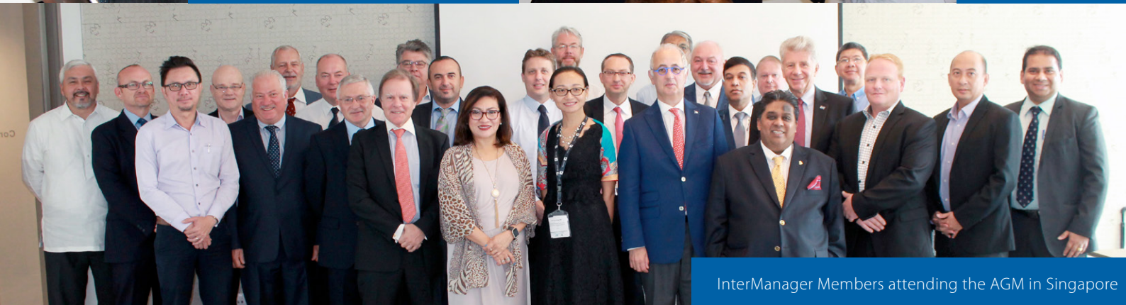
InterManager Members attending the AGM in Singapore